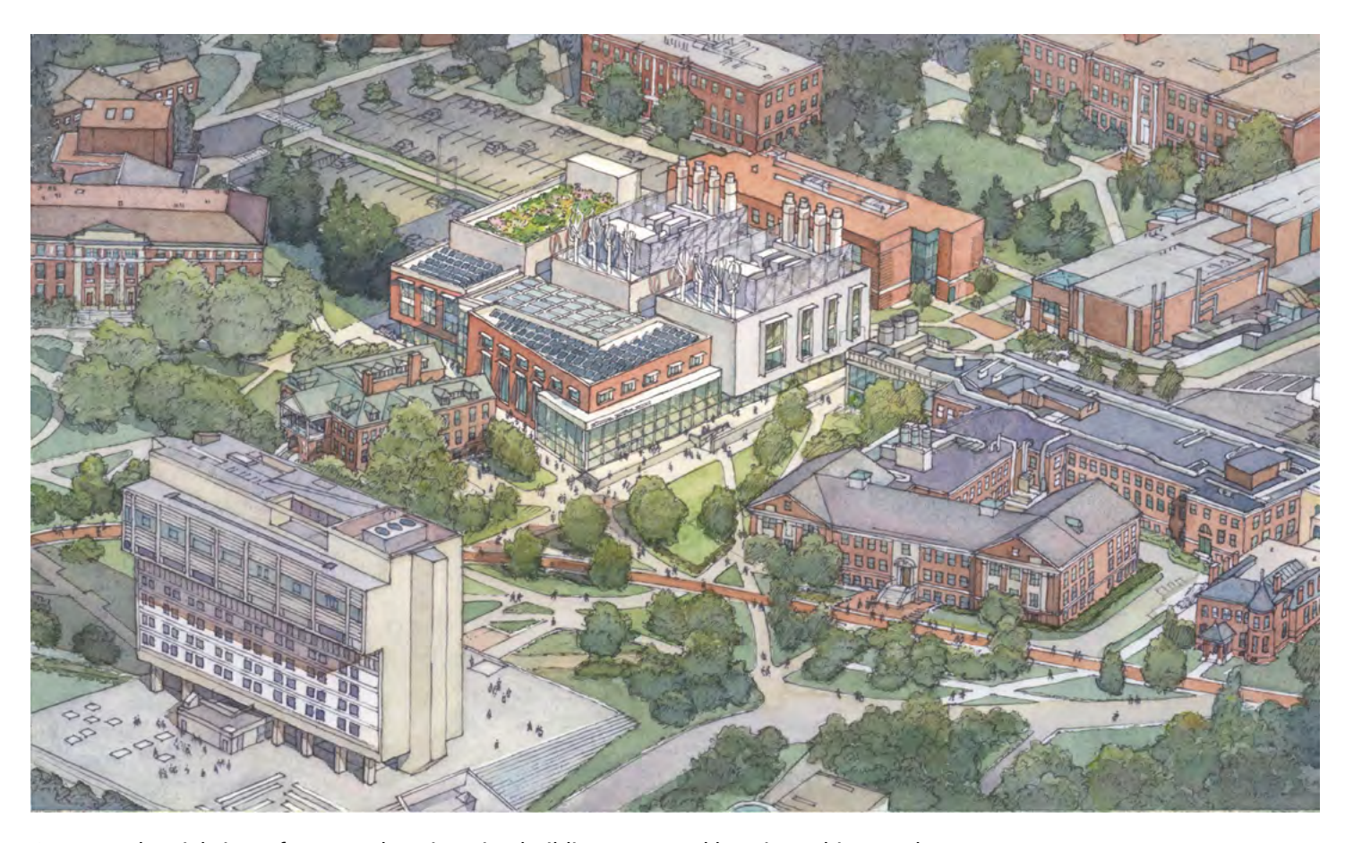
Conceptual aerial view of proposed engineering building. Proposed location subject to change.